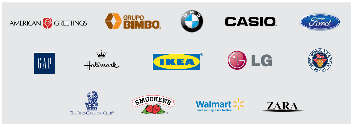
Figure 3. Great Family Business Brands

See Figure 3 for examples of great family business brands. These, along with premium names like Prada, Hermès, Salvatore Ferragamo, Grupo Femsá's Dos Equis, The New York Times, The Wall Street Journal, Copa Airlines and Bacardi, all highlight the significant potential that families have to build great reputations and continue the spirit of enterprise.